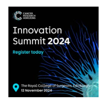
12th November 2024 The Royal College of Surgeons, Edinburgh

Join us for a day filled with inspiring talks from researchers who are translating their research and connect with members of the entrepreneurial ecosystem.