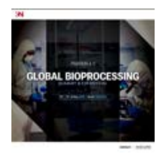
10th - 20th May 2023 Maritim proArte Hotel, Berlin

The Global Bioprocessing Summit brings together industry leaders, biotech, leading scientists and engineers to share day-to-day challenges and practical solutions for the development and manufacturing of quality cell lines, antibodies, vaccines, cell and gene therapies. This world class conference is focused on 2 overarching topics: