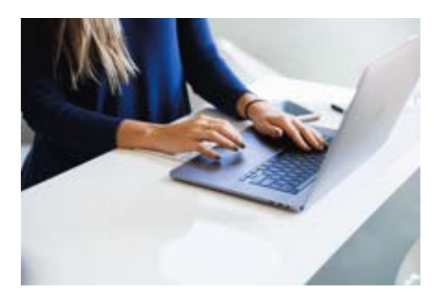
Got a spare minute?

Please take some time out to fill in our quick survey which will help us gain a better understanding of what's important to you when it comes to our events. This will also help us focus on your needs and ultimately make our future events more tailored to you!