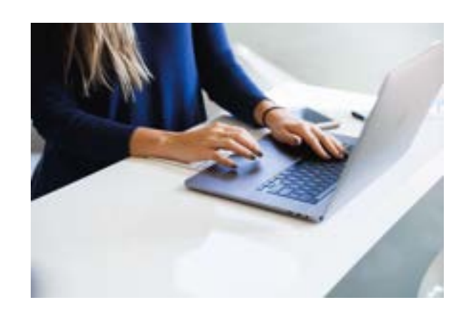
Got a spare minute?

Please take some time out to fill in our quick survey which will help us gain a better understanding of what's important to you when it comes to our events. This will also help us focus on your needs and ultimately make our future events more tailored to you!